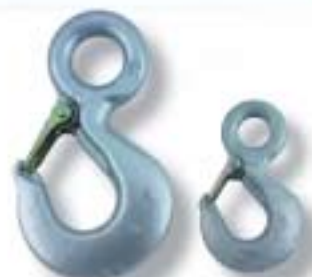
Eye Hook - EH