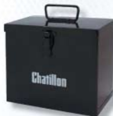
Optional Carrying Case

Notes: Dynamometers with "EH" come standard with Eye Hook. Dynamometer with "SH" come standard with Swivel Hook. Carrying Case must be ordered separately.