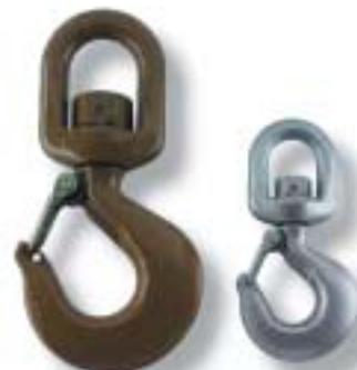
Swivel Hook - SH