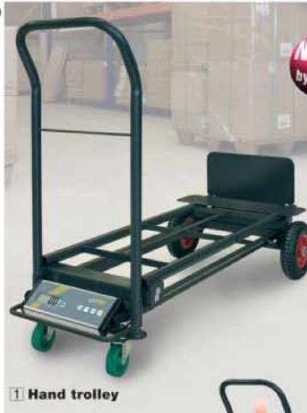
1 Hand trolley