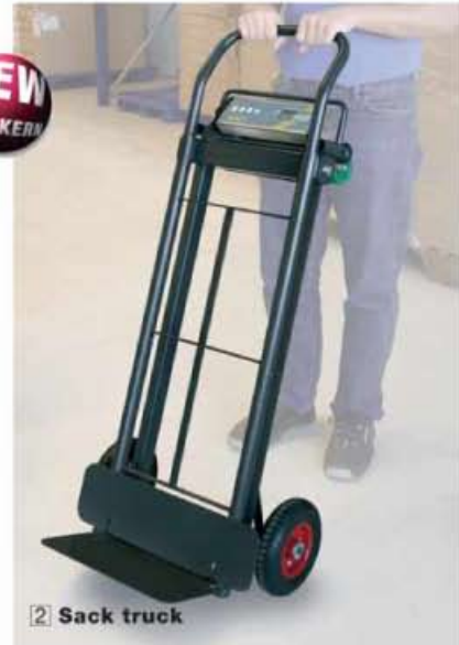
2 Sack truck